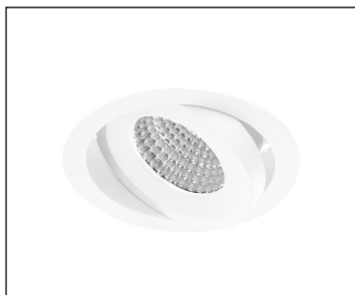
W White Trim