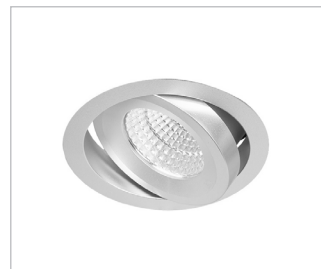
S Silver Trim