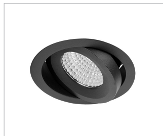
B Black Trim