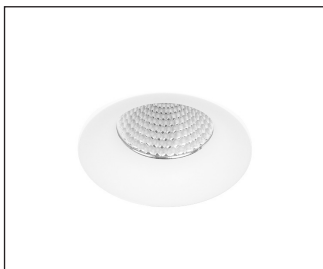
W White Trim