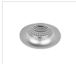
S Silver Trim