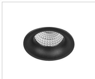
B Black Trim