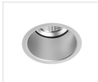
S Silver Trim