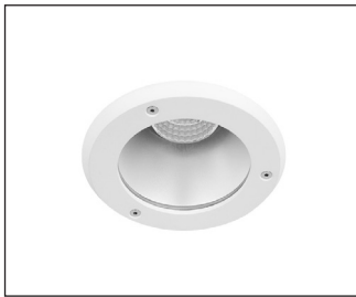
W White Trim