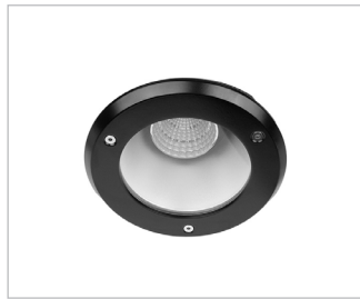
B Black Trim