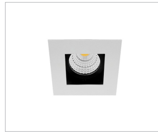
S Silver Trim