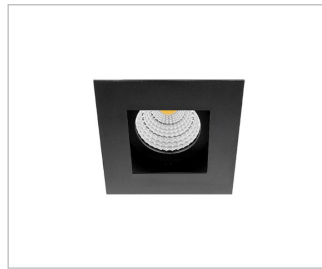
B Black Trim