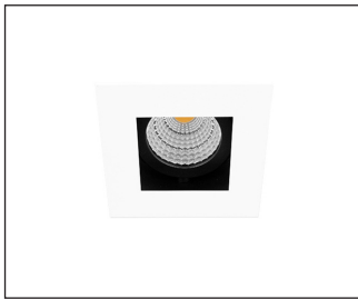
W White Trim