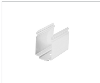
SSC Stainless Steel Clips