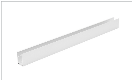
ALP Aluminium Profile