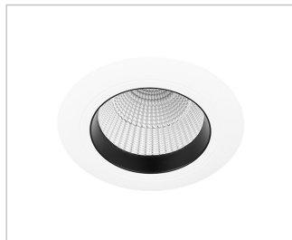
BI Black Insert