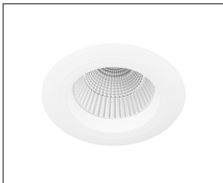
WI White Insert