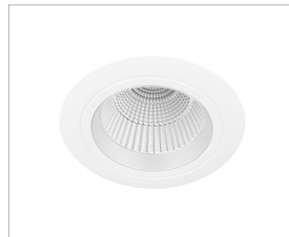
SI Silver Insert