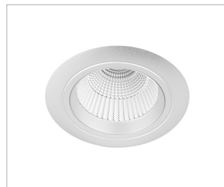
S Silver Trim