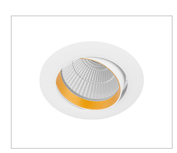
WI White Insert