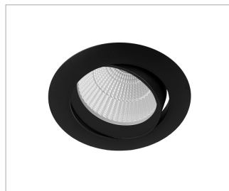
B Black Trim