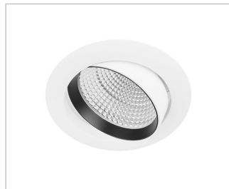
BI Black Insert