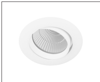
WI White Insert