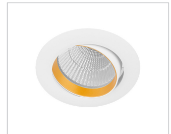
GI Gold Insert