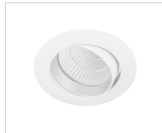
SI Silver Insert