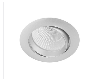
S Silver Trim