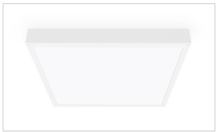
Surface Mounting Kit