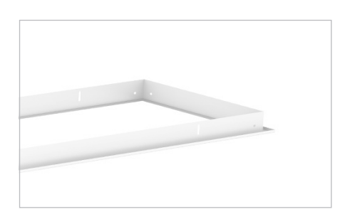
Plaster Recessing Kit