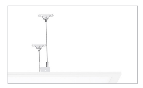
SP Suspension Kit