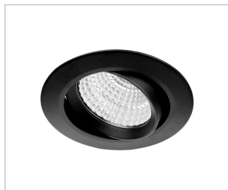
B Black Trim