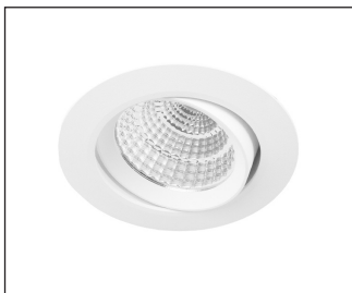
W White Trim