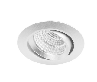
S Silver Trim