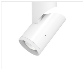
W White Trim