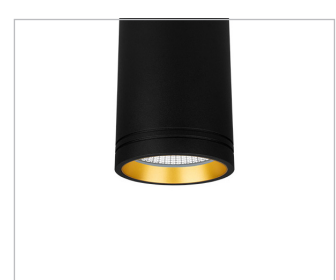
GI Gold Insert